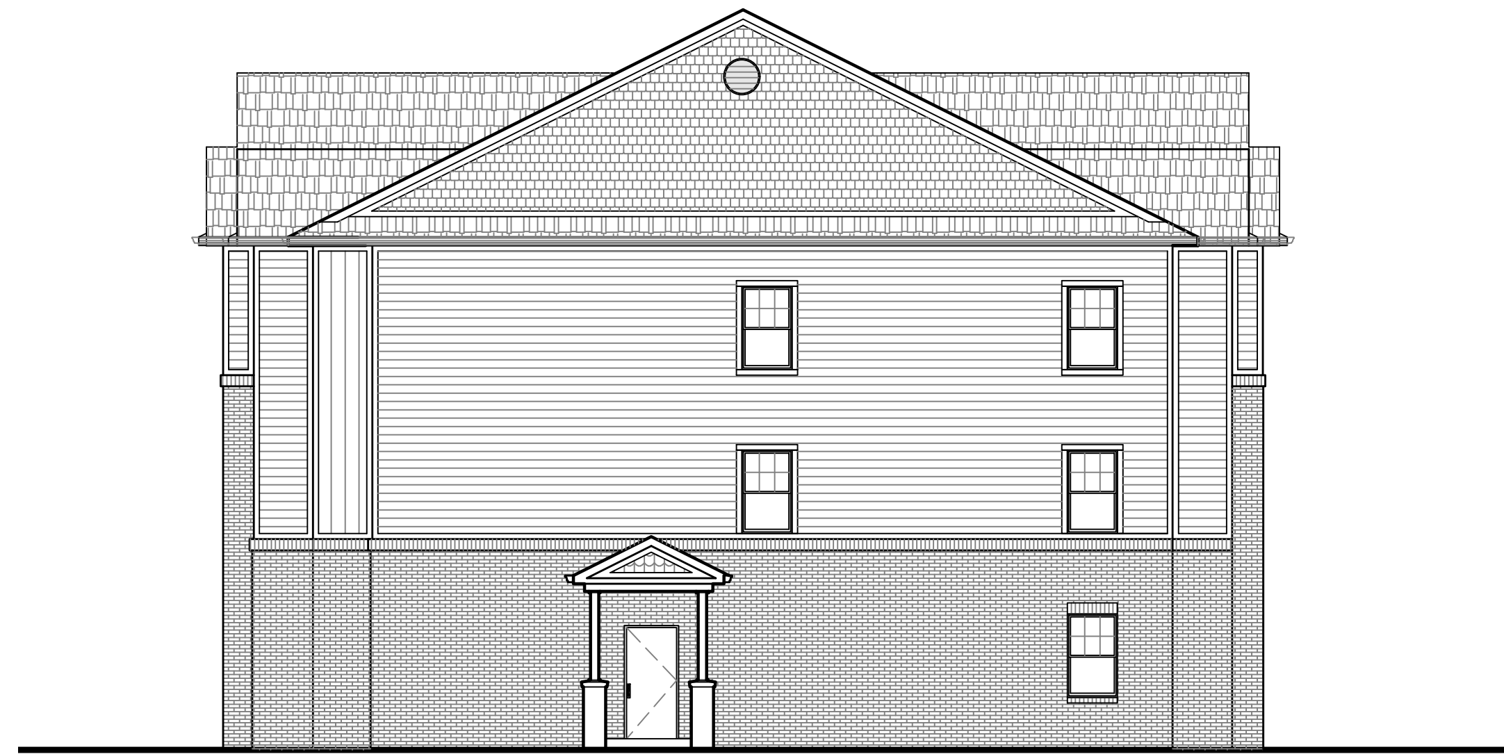
D EAST ELEVATION