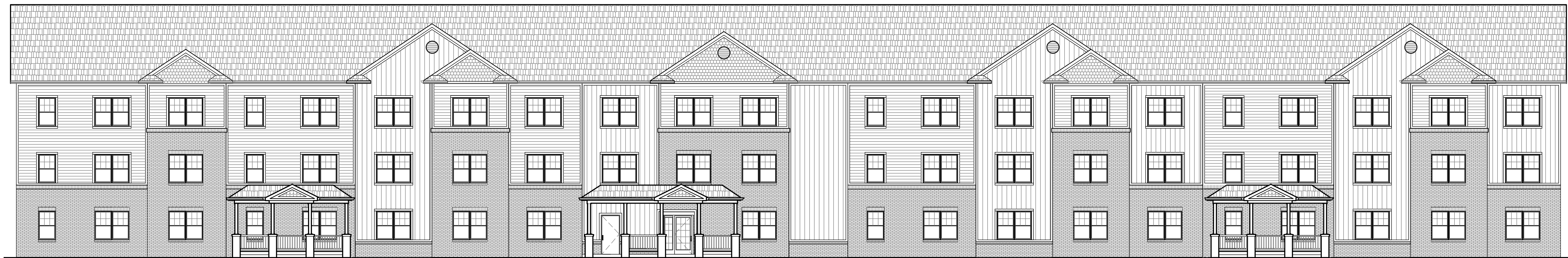
B NORTH ELEVATION