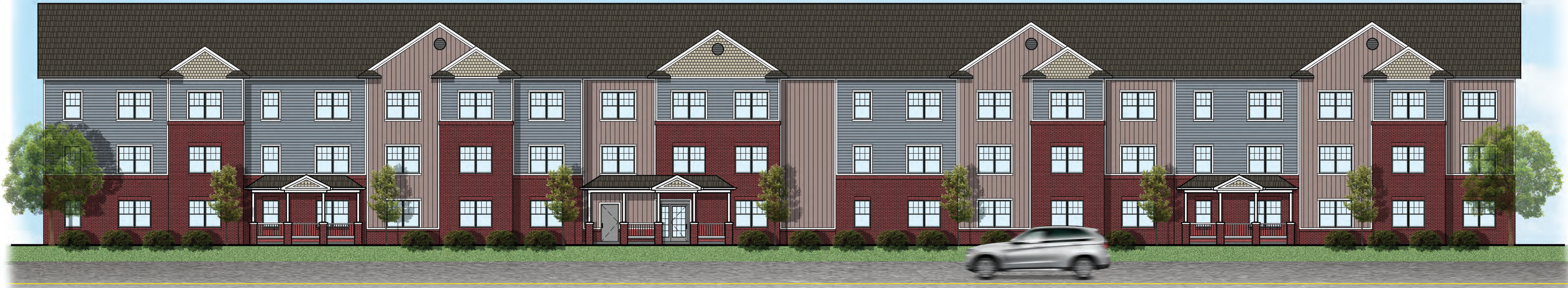
B NORTH ELEVATION