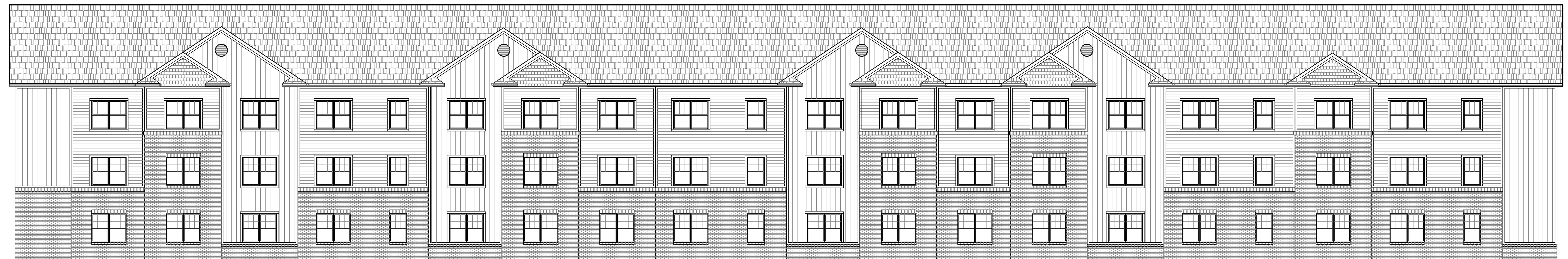
A SOUTH ELEVATION